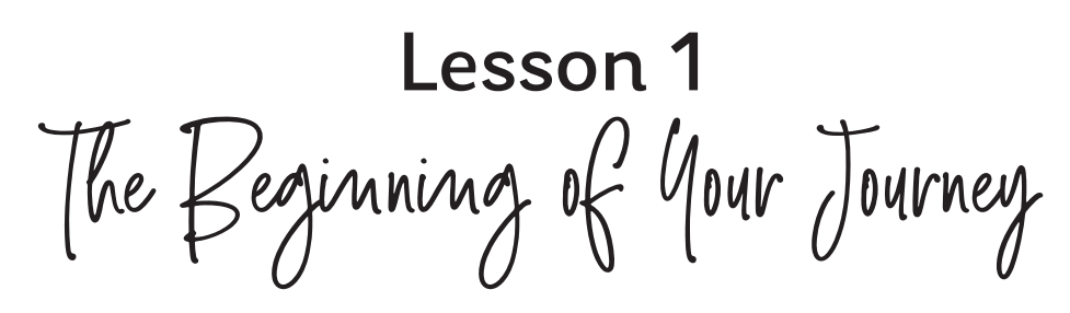
This first lesson is intentionally shorter than the rest. This is to give the class time to get to know each other and the Crossroads program.